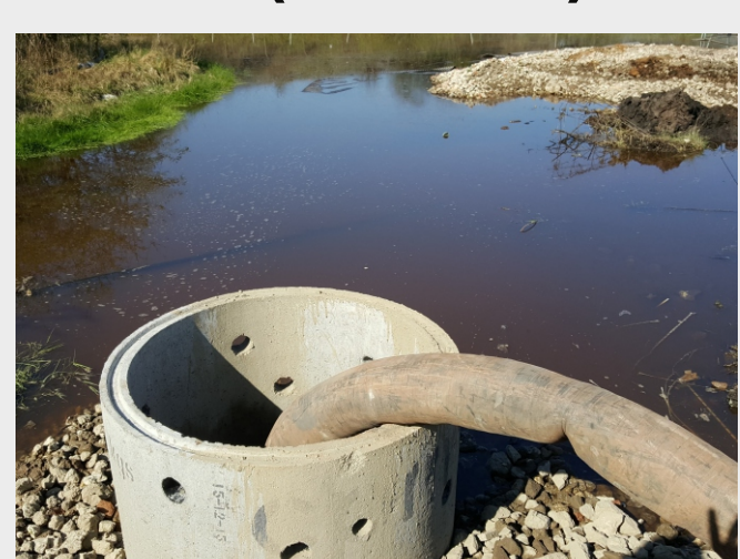
Pump & Treat