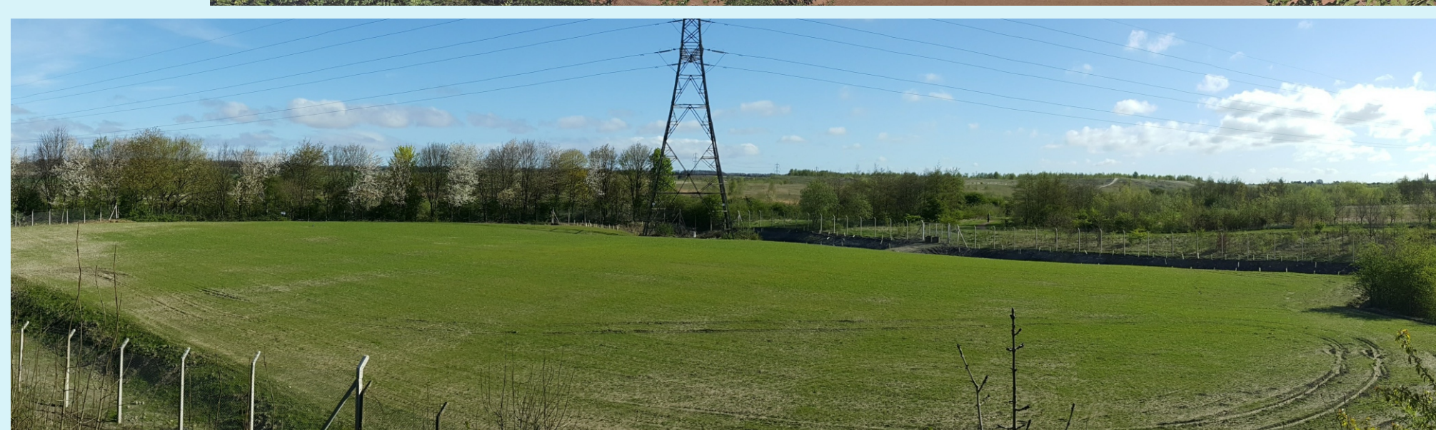
Closure of Landfill 227 in Castleford